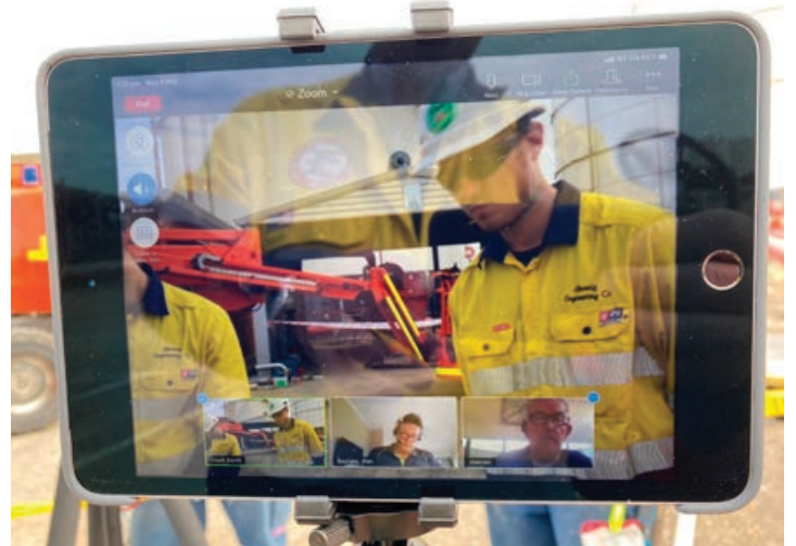
We have worked hard to adapt our operations to remain COVID-safe, including increasing the use of virtual meetings where possible.

Despite all the challenges posed by the global pandemic we remain committed to engaging with and supporting the local community. I am so pleased that this year we have been able to maintain our support of local schools through our Bright Future Grants, which help to inspire students' interest in the fields of maths and science. As well as contributing to St Joseph's School as outlined in the story on page 2, we also supported science and maths education at Largs Bay School with a Mobil Bright Future Grant this year.