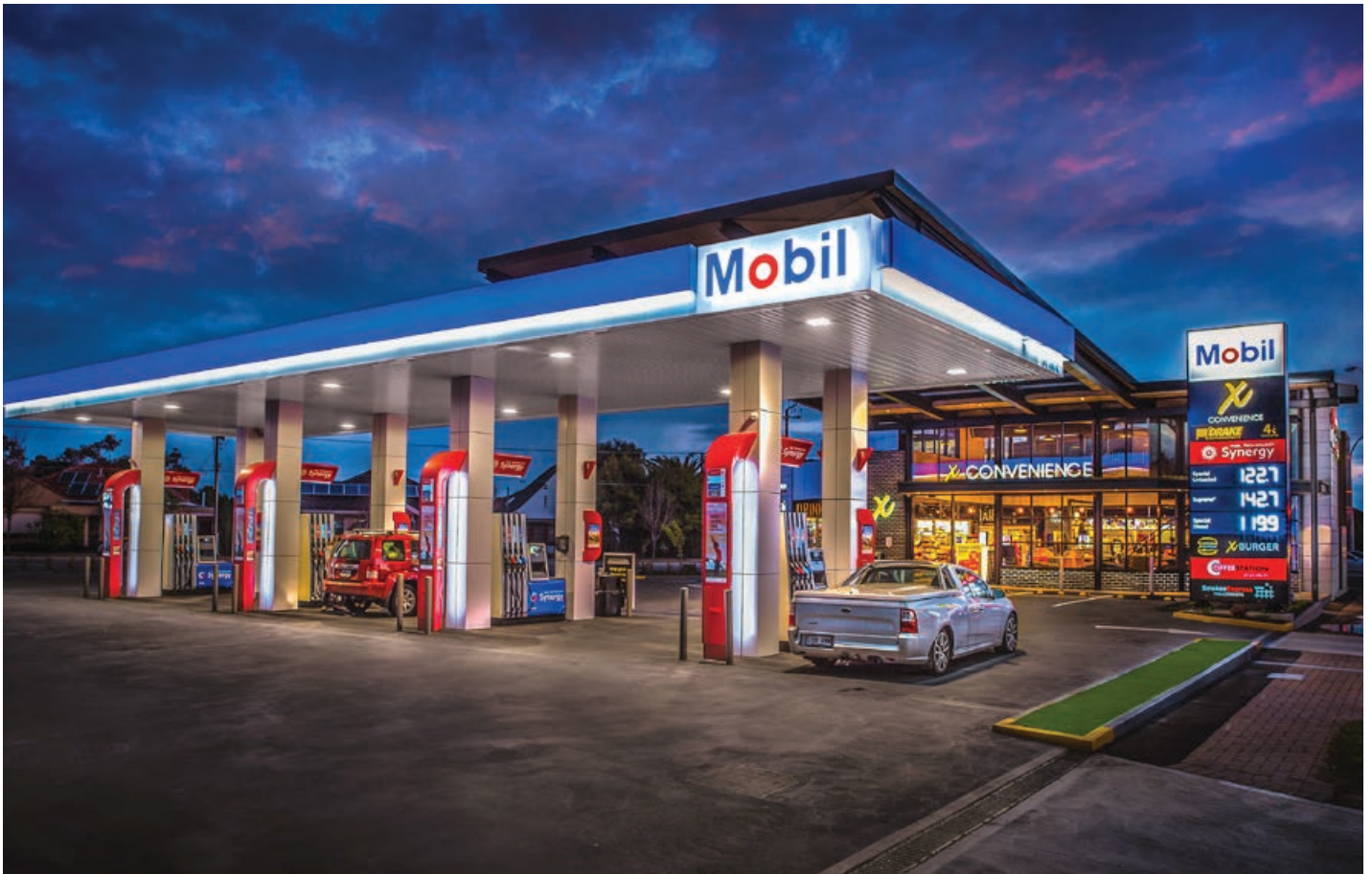
You can purchase Mobil fuel from a growing network of Mobil branded service stations in South Australia? Find your nearest Mobil service station at www.mobil.com.au